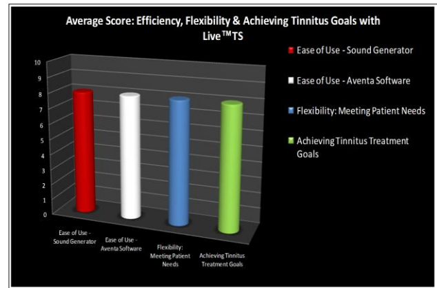
Figure 1: Average scores of different measured parameters of Live™TS.